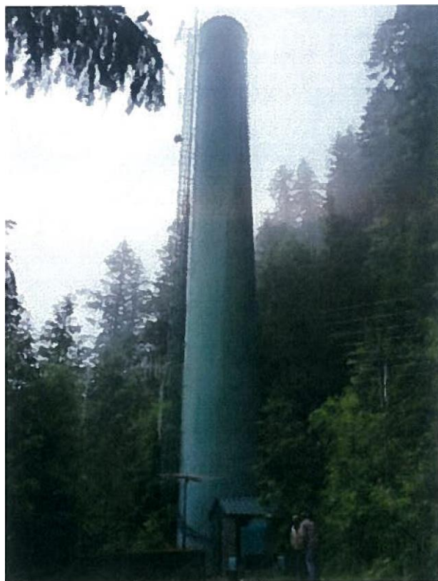
Facility #1 — Energy Northwest