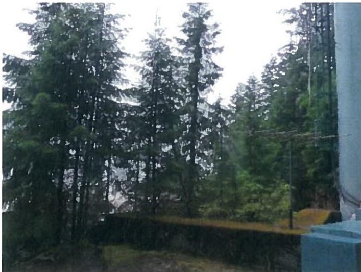
Twin City Gospel antenna