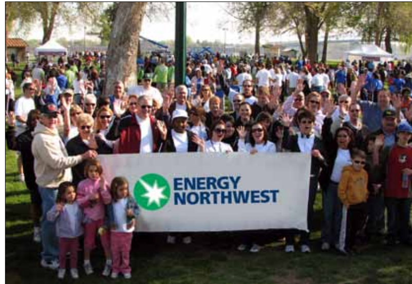
Energy Northwest employees believe in giving back to the community. In 2010, employees raised more than $150,000 in donations to local charities, such as United Way and March of Dimes.