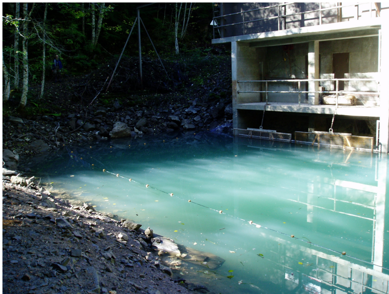
Photo 1. Location of experimental gillnet, Packwood Lake intake structure.

EES Consulting requested and was awarded a Scientific Collectors Permit (SCP) for the Project in October 2004. Energy Northwest was permitted to electrofish upstream of the anadromous salmonid reach and use an experimental, variable-mesh gillnet to capture fish just upstream of the Project intake (see Photo 1). EES Consulting used a Smith-Root LR 24 Backpack Electrofisher. The net was 150 ft (45.7 m) long and 8 ft (2.4 m) deep with various sized meshes ranging from ¼ in (6.4 mm) to 3 in (76.2 mm) stretched mesh.