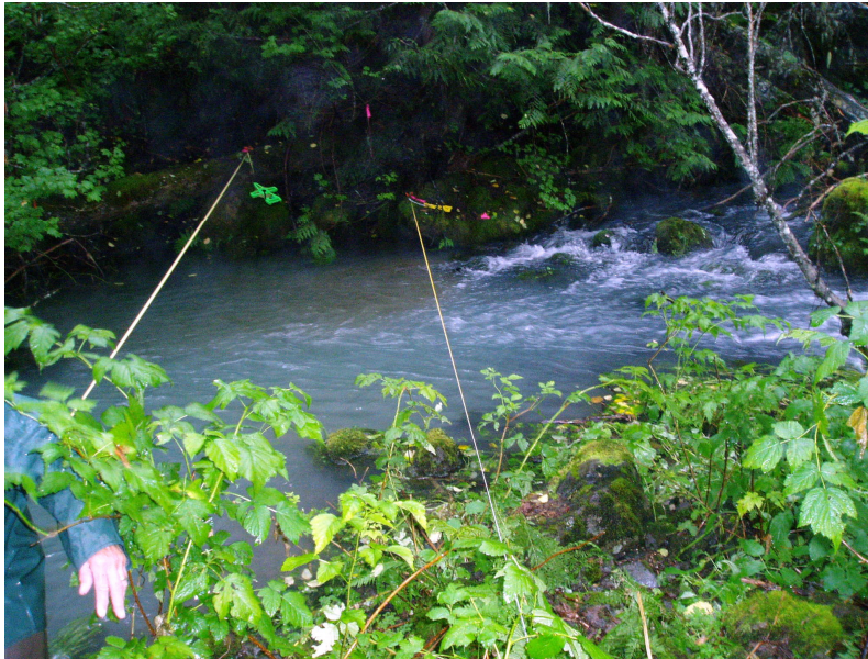
Photo 2. Location of Electrofishing surveys, Lake Creek Study Site 4 [Note: survey was not conducted at this calibration flow for the instream flow study, but rather the current instream flow of 3 cfs from the drop structure].