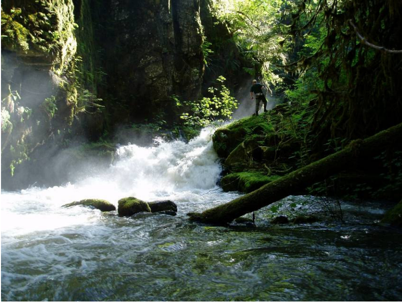
Lower barrier, 300 cfs