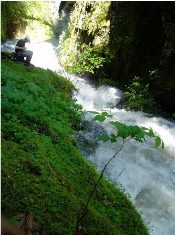
Lower barrier, 300 cfs