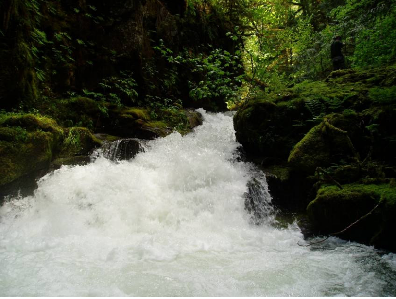
Barrier from below falls, 130 cfs