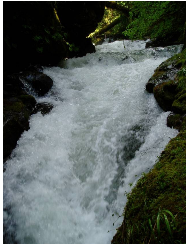
Barrier looking up the falls from lip 130 cfs