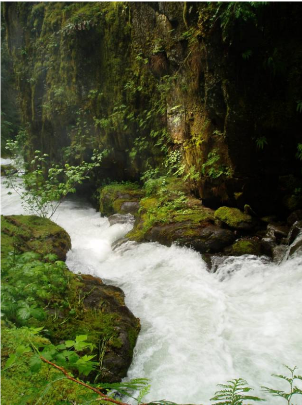
Barrier looking downstream, 130 cfs