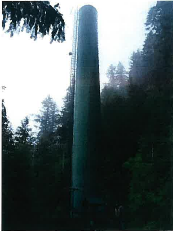
Facility #1 — Energy Northwest