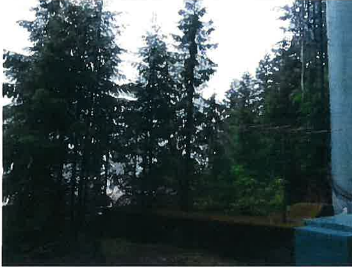
Twin City Gospel antenna