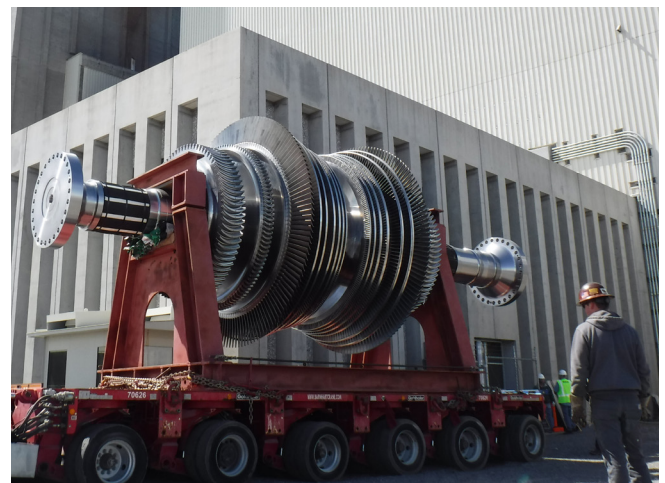
Low pressure rotor being delivered to the turbine building.

- Grover Hettel, Energy Northwest chief nuclear officer